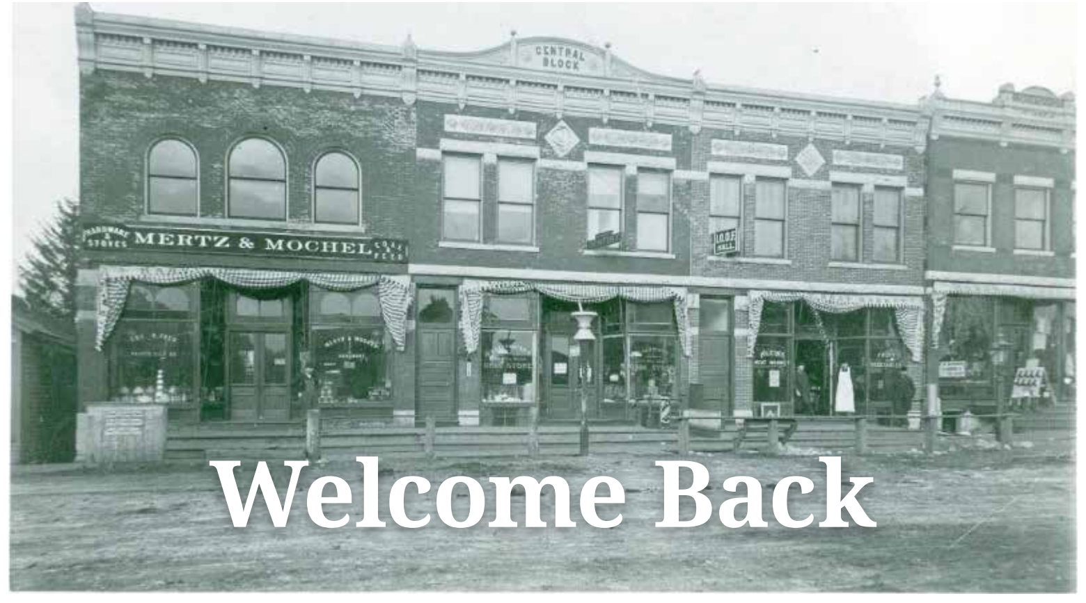
Main Street Downers Grove, circa 1900. Pictured left to right...Mertz and Mochel Hardware (before its expansion south in 1923), Carpenter's Drug Store, Klein's Meat Market, Downers Grove Fair (dry goods Store)

The Downers Grove Historical Society is pleased to say -- "We're Back!" Of course...we never really went away, but our Newsletter did...so now you'll be hearing more from us in the future. We've been busy keeping history alive for future generations by preserving and promoting the heritage of Downers Grove. We rely solely on public support to continue these efforts. Please donate your time and resources as you can.