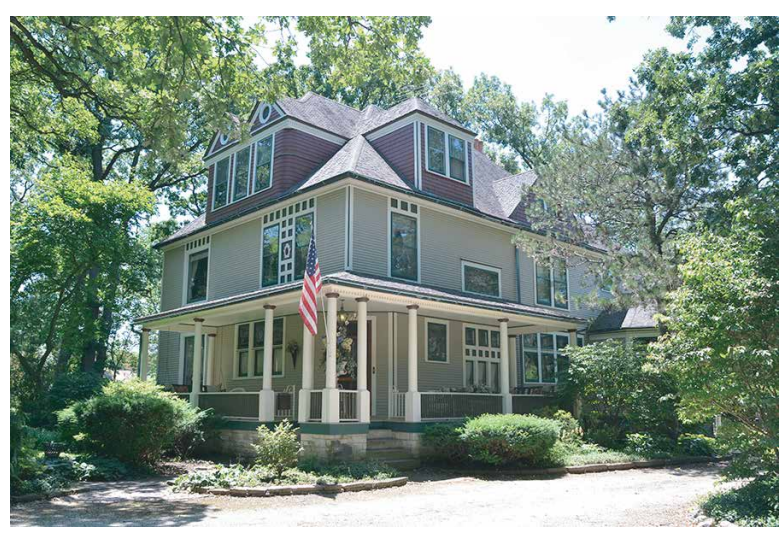
4714 Oakwood Avenue.