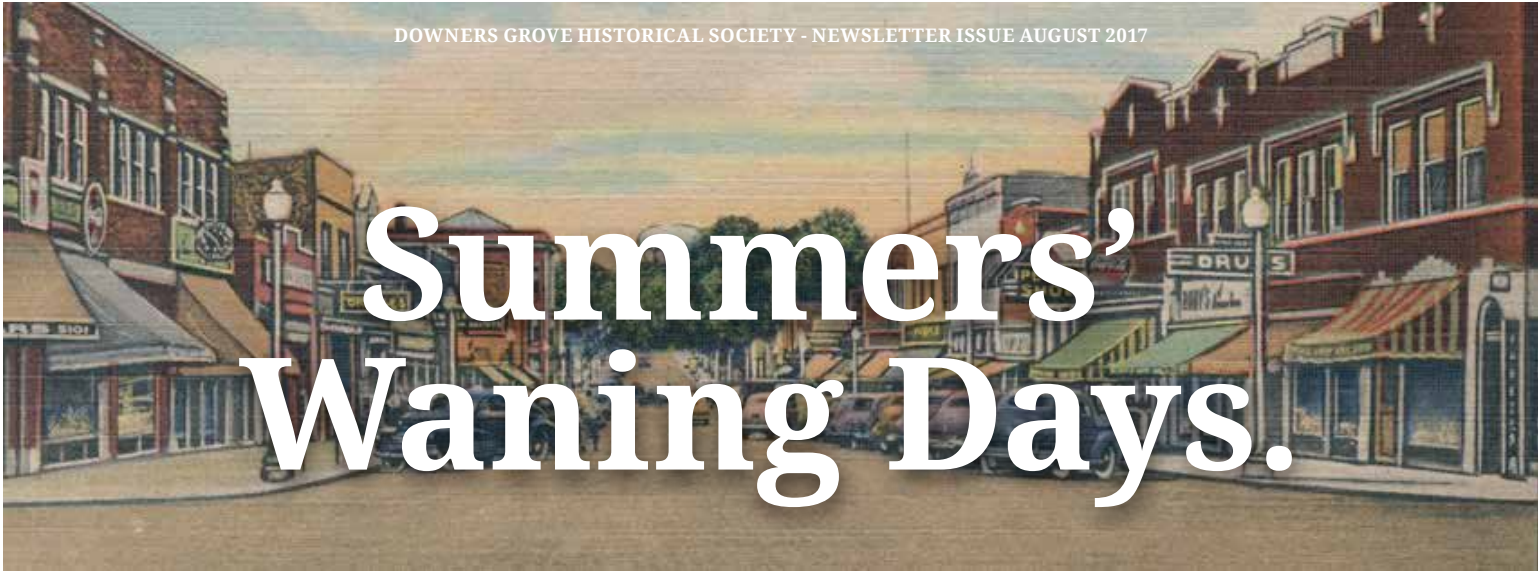
Main Street Downers Grove, circa 1940's. The scene is looking South down Main Street from Curtiss Street.

As the heat and humidity of early August begins to fade the memories of a long and fruitful summer, the Downers Grove Historical Society is hard at work uncovering new initiatives and creating momentum in serving and preserving history.