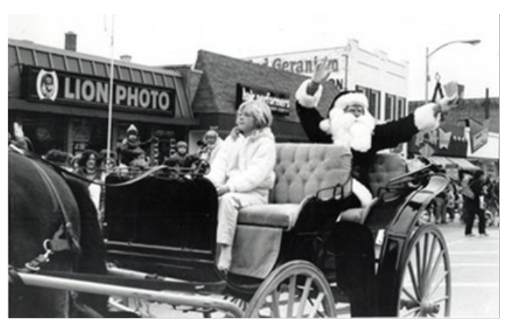
1984 - Christmas Parade in Downtown Downers Grove