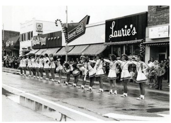
1985 - Hospitality Day in Downtown Downers Grove