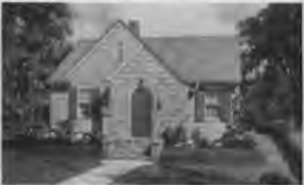
Popular Style Cottage Four Rooms and Bath Fair Oaks—No. 2322— At Low as $25 a Month